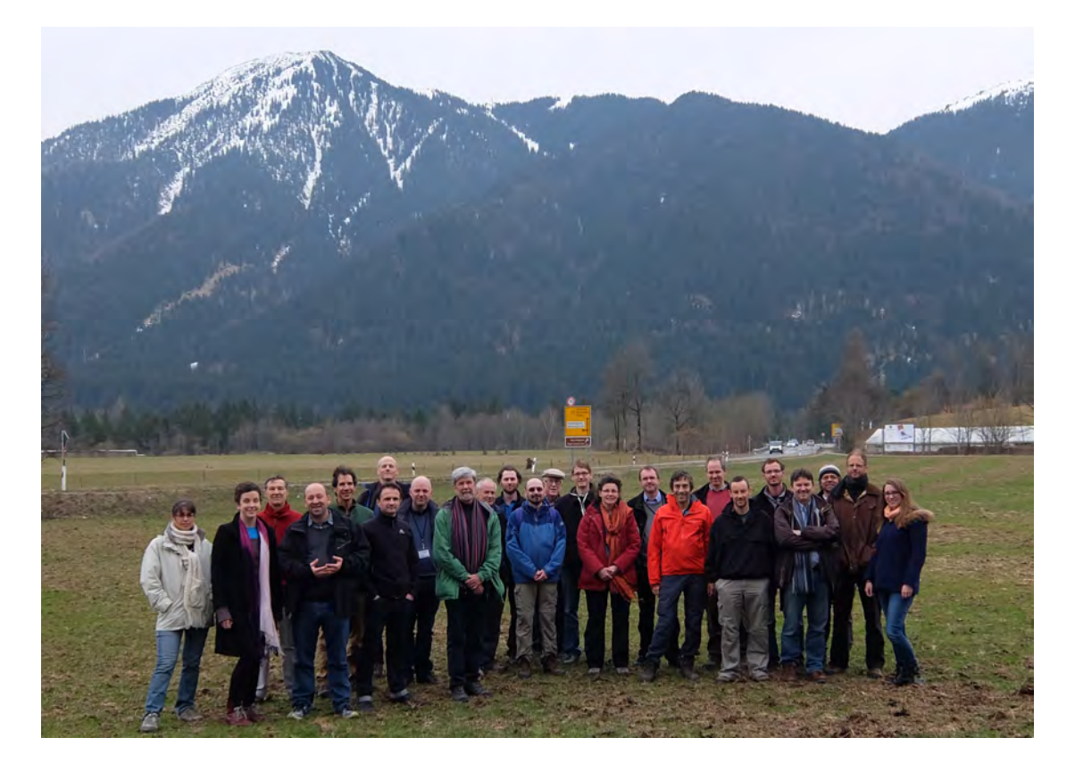
Figure 1: Participants (at least most of them) on the way to town.