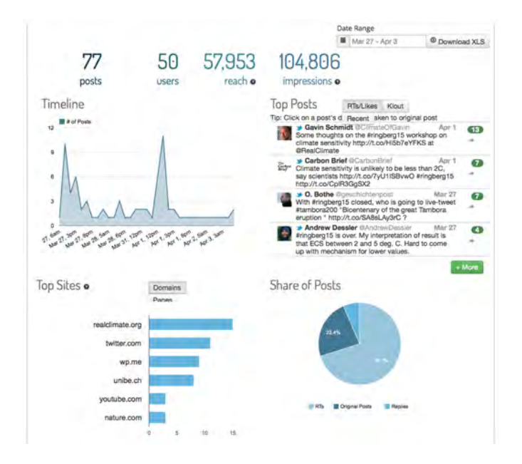
Figure 4: A snapshot of the tracking statistics from the Ringberg15 hashtag. Ringberg15 featured prominently in the social media.