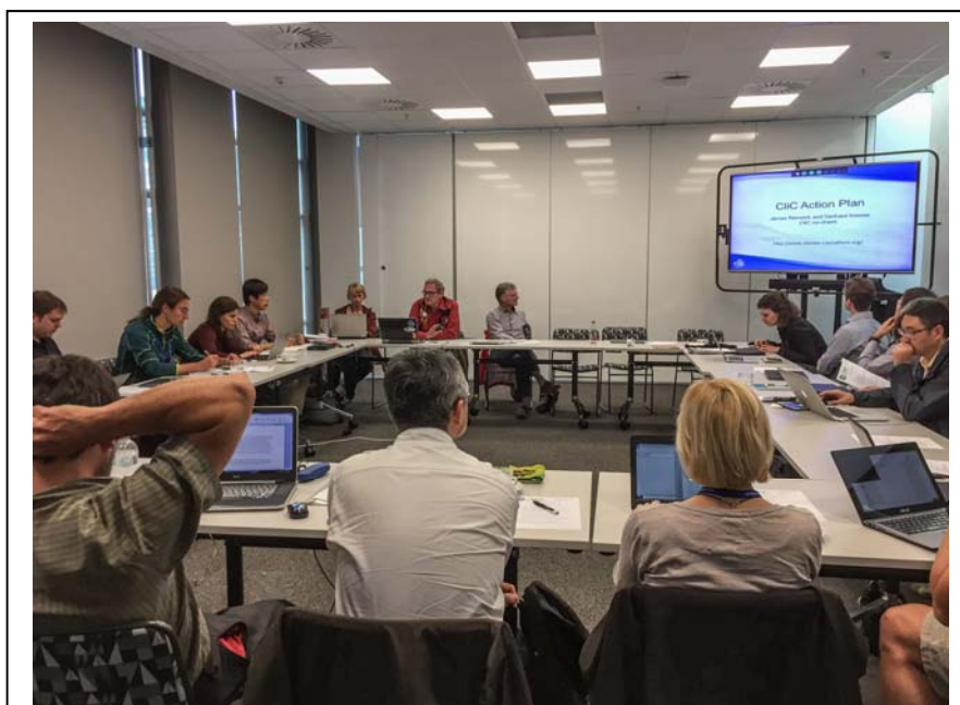
CliC SSG 13, Day 1, February 2017, Wellington, New Zealand