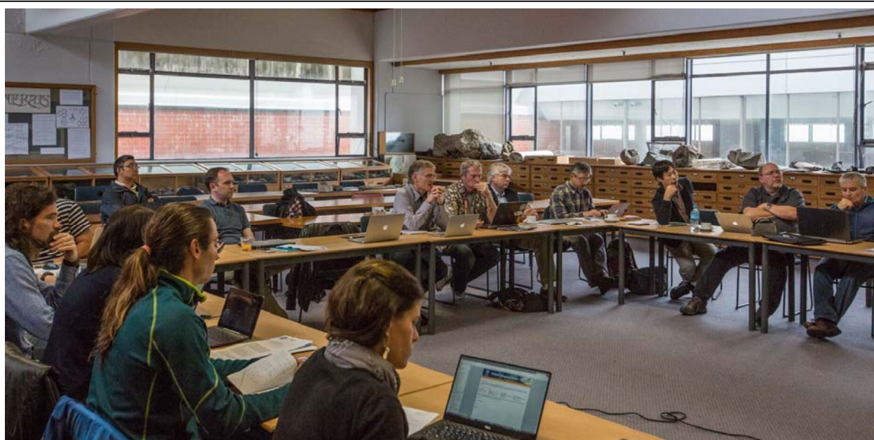
CliC SSG 13 Meeting, Day 2, February 2017, Wellington, New Zealand