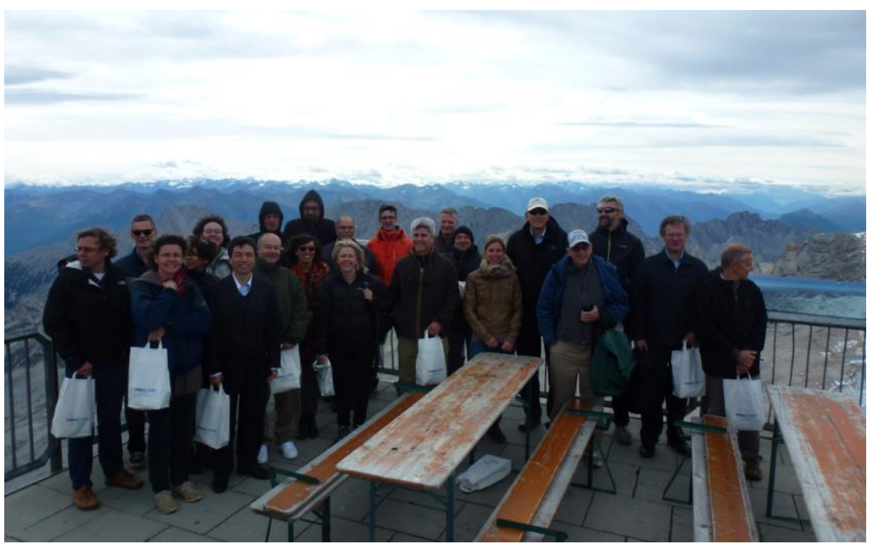
WGCM18 participants at the Zugspitze