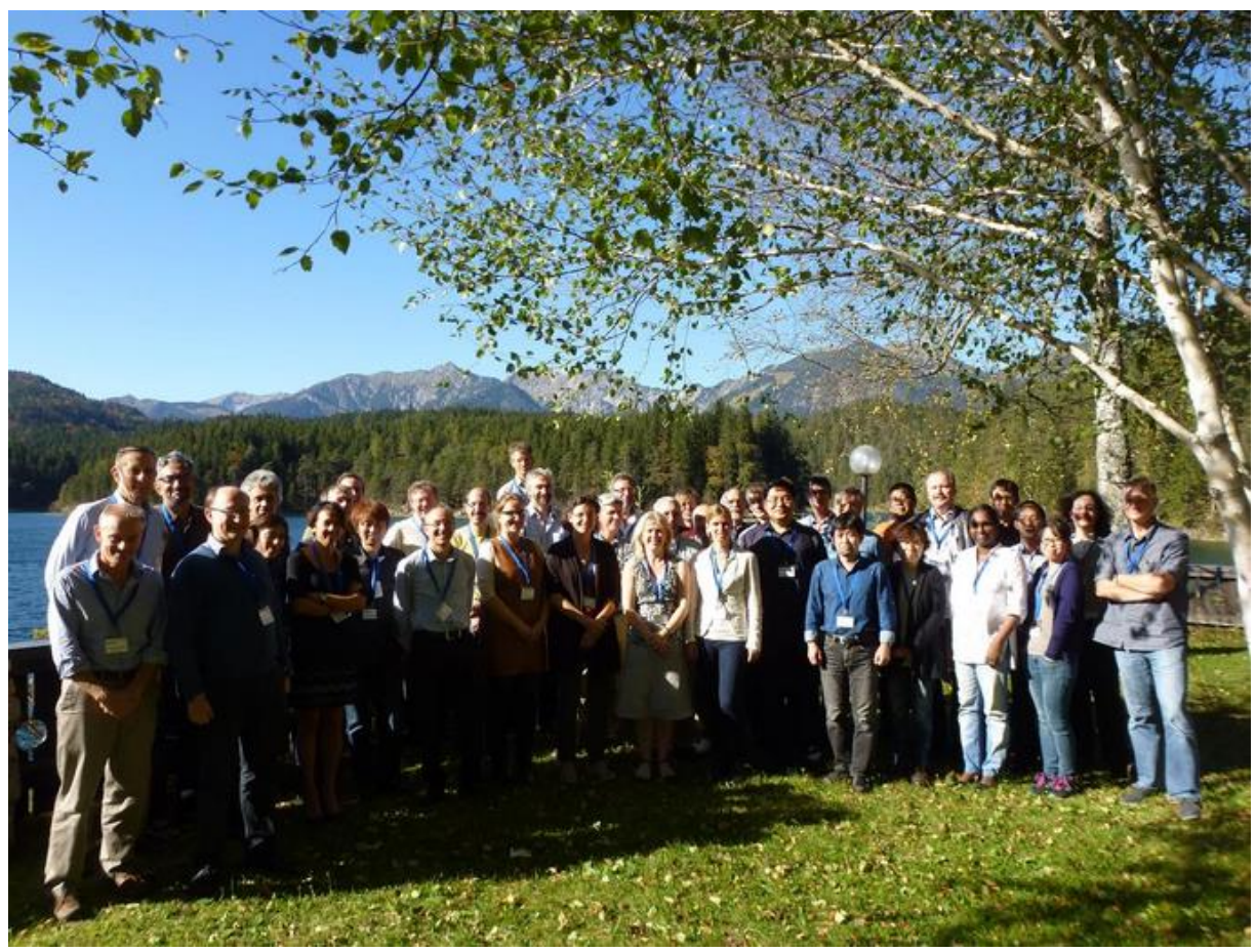
WGCM18 participants in front of the Eibsee