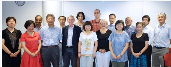
August 2013, Hong Kong, China - MAIRS organised a meeting to input into Future Earth and to develop a strategic science plan for a “Future Asia” under the Future Earth umbrella. RIHN, ICSU-ROAP, APN among others....