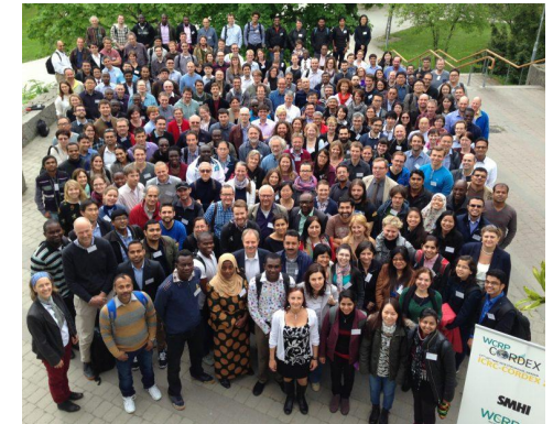
May 2016, CORDEX-2016 supported APN goals of enhancing regional cooperation and capacity, and APN provided funding for early-career professionals from its member countries to participate.