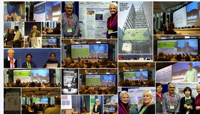
November 2013, European Commission, Brussels, Belgium - APN is sponsoring and actively engaging in the International Conference on Regional Climate: CORDEX 2013 by presenting and showcasing its recent work, chairing sessions and judging young scientists' posters.